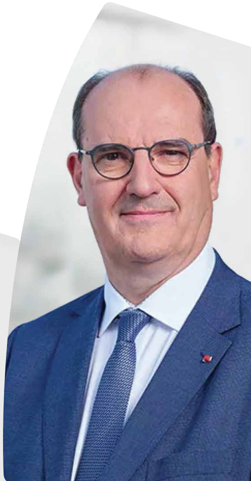
Jean Castex Chairman and CEO